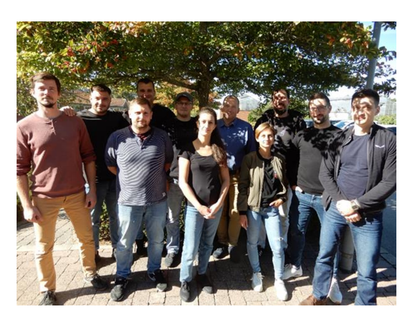
DFA MSP Team 2022-23

The DFA CMP course for Crop managers is scheduled to start in week 8, 2023 (February 21 - 24) with the first seminar in Denmark. The second of three will be held in Romania (7-9 June) and the final seminar in Slovakia in November 2023.