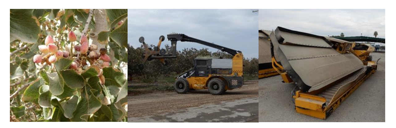
Pistachios, tree pruning machine and a pistachio harvester

The first visit went to Burrel Farm – owned by Ingleby Farms . They have 1.394 ha with pistachio trees and a further approx. 400 ha used for other crops and for uncultivated land to promote biodiversity. Here we got a detailed impression of how pistachios are grown and how they are subsequently processed in the company's own factory right next to the farm. At the brand-new factory facility, each individual pistachio nut is photographed so that they can sort by size and ensure quality. A 10-year-old pistachio tree can harvest approx. 8-10 kg of nuts per year. Leguminous plants are grown between the rows of trees, which later are grounded.